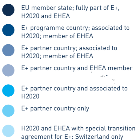
Map of countries participating in Erasmus+, Horizon 2020 and the European Higher Education Area.

Universities in the neighbourhood and EU universities engage in numerous capacity-building collaborations to promote durable partnerships and foster the development of universities and higher education systems. In 2007–2013, 922 universities in the neighbourhood and accession countries took part in capacity building activities under the TEMPUS Programme alone (source: European Commission). Besides building capacity, such programmes bring together thousands of university leaders and managers, researchers, teaching staff and students, thus forming personal and professional ties.